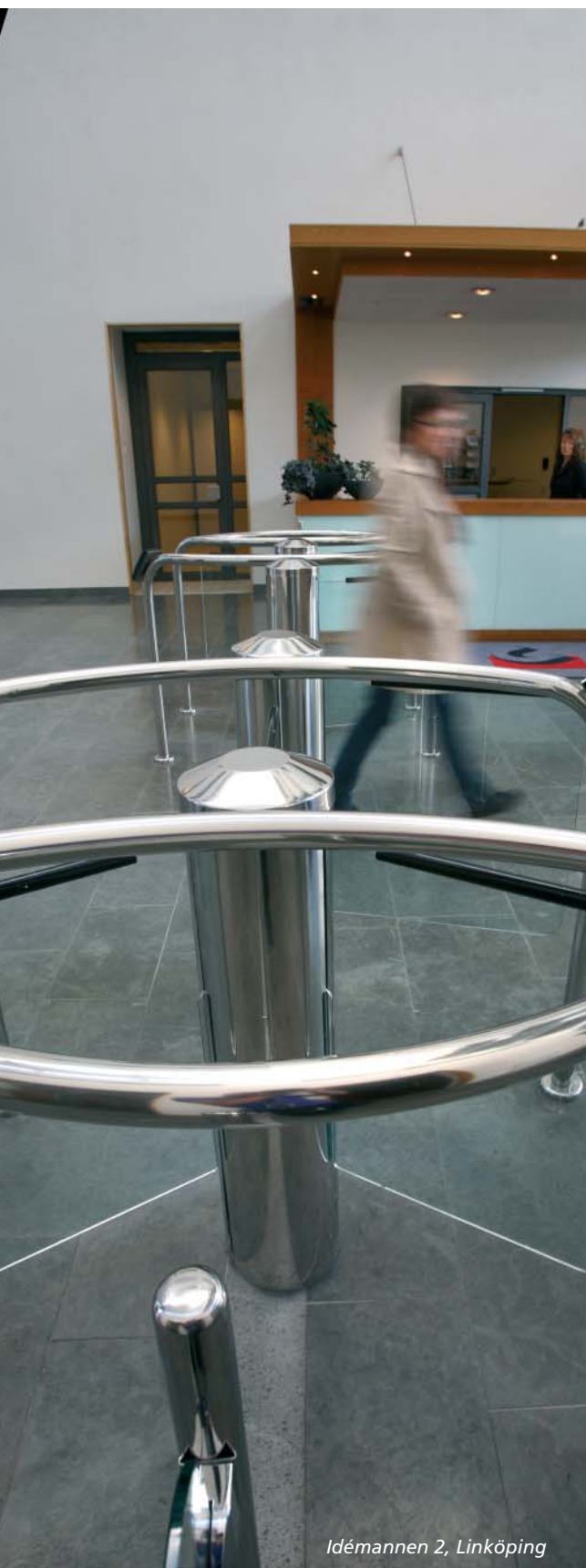
Idémannen 2, Linköping

Corporate governance covers the different means of decision making by which the shareholders directly and indirectly control the company. A high level of transparency in the information to shareholders and the capital market helps the decision making process run efficiently and provide different owners good insight into the operations of the company. Corporate governance has evolved through laws, recommendations, the so called "code", and through self regulation.